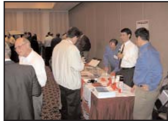
The Showcase was also very busy and exciting.