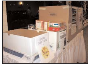
ISM-Milwaukee members collected over 130 pounds of food to be donated to the Hunger Task Force.