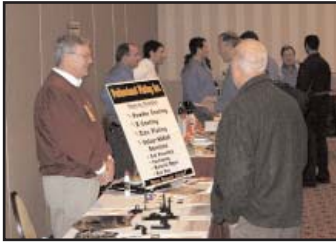
The Supplier Showcase prior to the November Dinner Meeting was very educational.